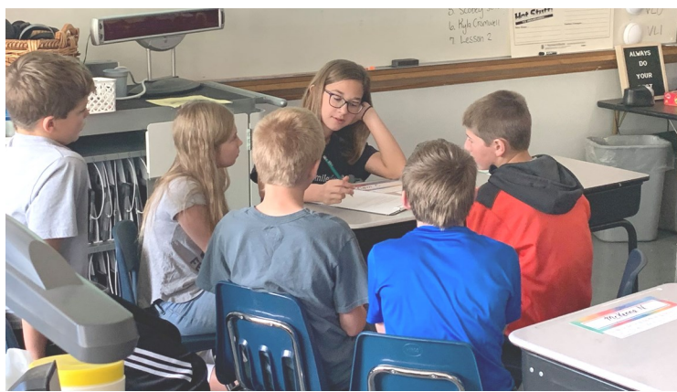
The "co-op" director writes down the notes to present to the entire "membership" of the class!